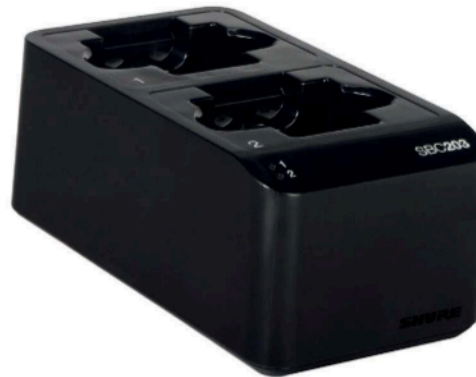
SBC203 Dual-Docking Recharging Station

Dual docking recharging station charges two SB903 lithium-ion batteries in or out of their transmitters. Built to charge two batteries, two body pack transmitters, two handheld transmitters or any pairing of two SLX-D transmitters or SB903 batteries.