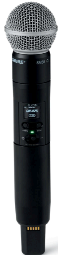
SLXD2+/58 Digital Wireless Handheld Transmitter