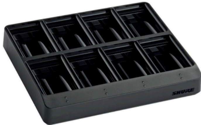
SBC80-903 8-Bay Battery Charger

Recharging station for up to eight (8) SB903 rechargeable lithium ion batteries. The charging cradle is designed to fit in a rackmount drawer and provides a full charge for installed batteries in 3 hours. LED indicators illuminate to indicate battery health and charging status.