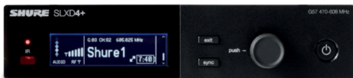
SLXD4+ Front Panel