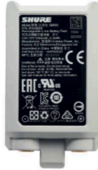
SB903 Rechargeable Lithium Ion Battery