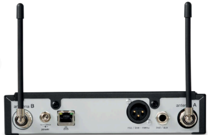
SLXD4+ Back Panel