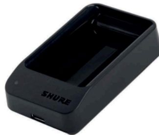
SBC10-903 Single Battery Charging Sled