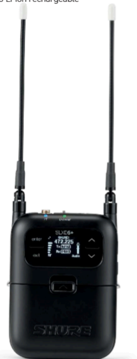
SLXD5+ Single-Channel Portable Digital Wireless Receiver