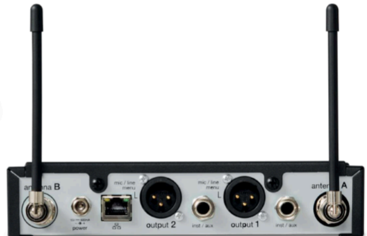
SLXD4D+ Back Panel