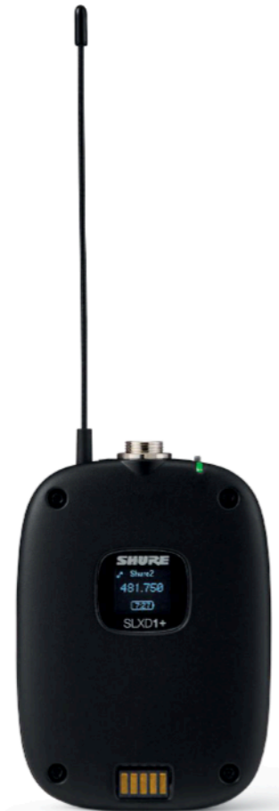
SLXD1+ Digital Wireless Bodypack Transmitter