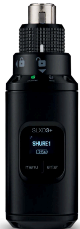
SLXD3+ Digital Wireless Plug-On Transmitter